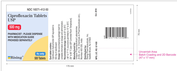
PACKAGE LABEL-PRINCIPAL DISPLAY PANEL - 750 mg (50 Tablet Bottle)